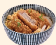
Signature Katsu $15.90