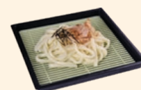
Mini Cold Udon +$4.90