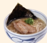
Mini Ramen +$5.90