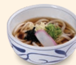
Mini Udon Soup +$4.90