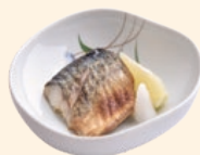
Mini Saba +$1.00