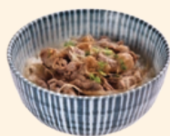
Signature YAYOI Beef $15.90