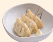
Age Gyoza (3 pcs)