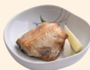
Mini Hokke +$1.00