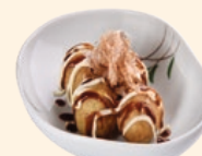
Takoyaki (4 pcs)